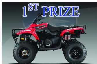
2010 330 Polaris Trailboss